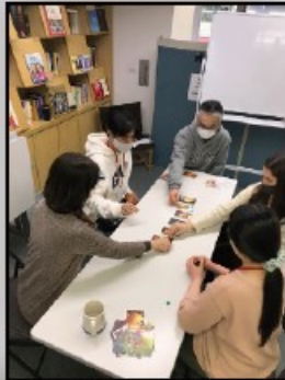
Day one of winter term!