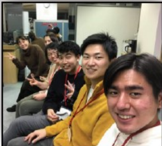
Left: These are our students for winter term.