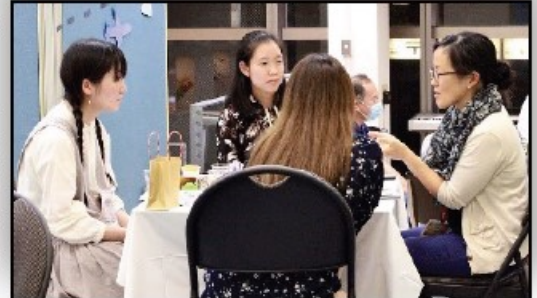
Right: We are so thankful that our English Café ministry has continued to grow in numbers and regular new attendees. Relationships are being built and there are gospel sharing opportunities!