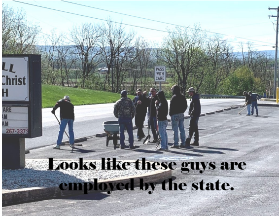
Looks like these guys are employed by the state.

The Property Managers thanks everyone that came out on Saturday morning, April 27th, to help with the outside clean up day. Many hands made the work enjoyable and light. The work looks beautiful and is much appreciated.