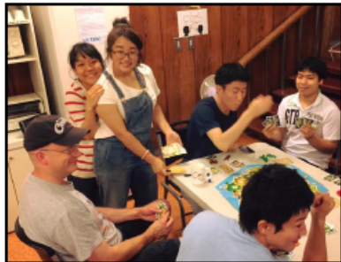
Left: Games with students.